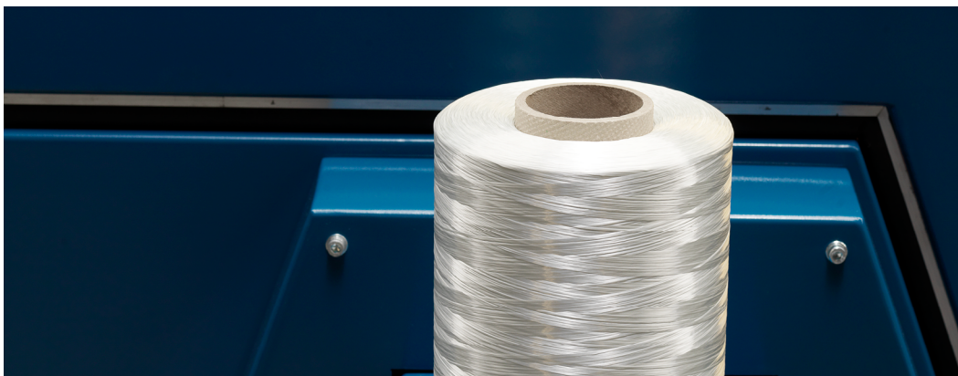
Roblon strength members may be utilised in the Eccentric Binder.