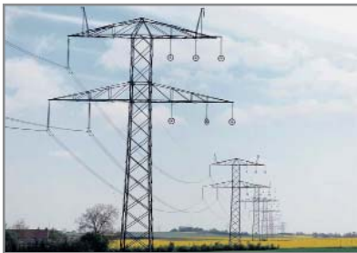
One transmission line is ready for stringing, whilst the other is live